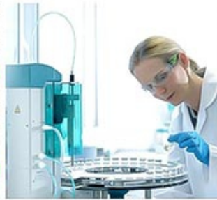
MEDICAL DEVICE INDUSTRY