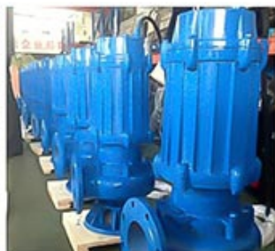
PUMPS & FLUIDS INDUSTRY