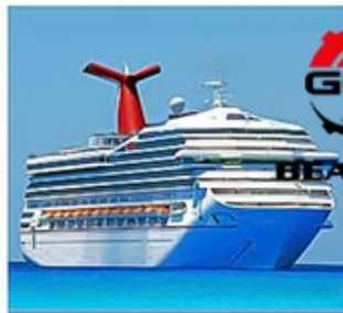
SHIP REPAIR INDUSTRY