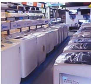
DOMESTIC ELECTRIC APPLIANCE