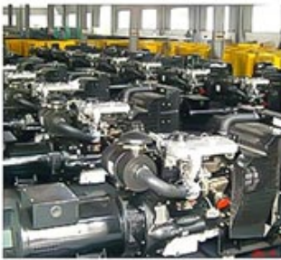
ELECTRIC MOTOR INDUSTRY