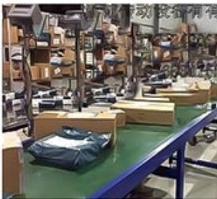
LOGISTICS AND TRANSPORTATION