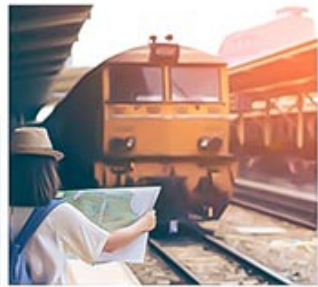
RAIL TRANSPORTATION INDUSTRY