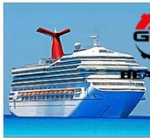
SHIP REPAIR INDUSTRY